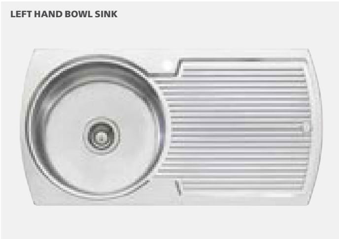
LEFT HAND BOWL SINK